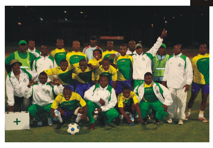
Winners: Limpopo Department of Public Works Soccer team that walloped Mpumalanga Department of Roads and Transport 3-0 in the finals.

The tournament was concluded by an award giving ceremony on the last day which was held at Cosmo-Leisure. Below are the results of the event. Next year the tournament will be held in the Freestate.