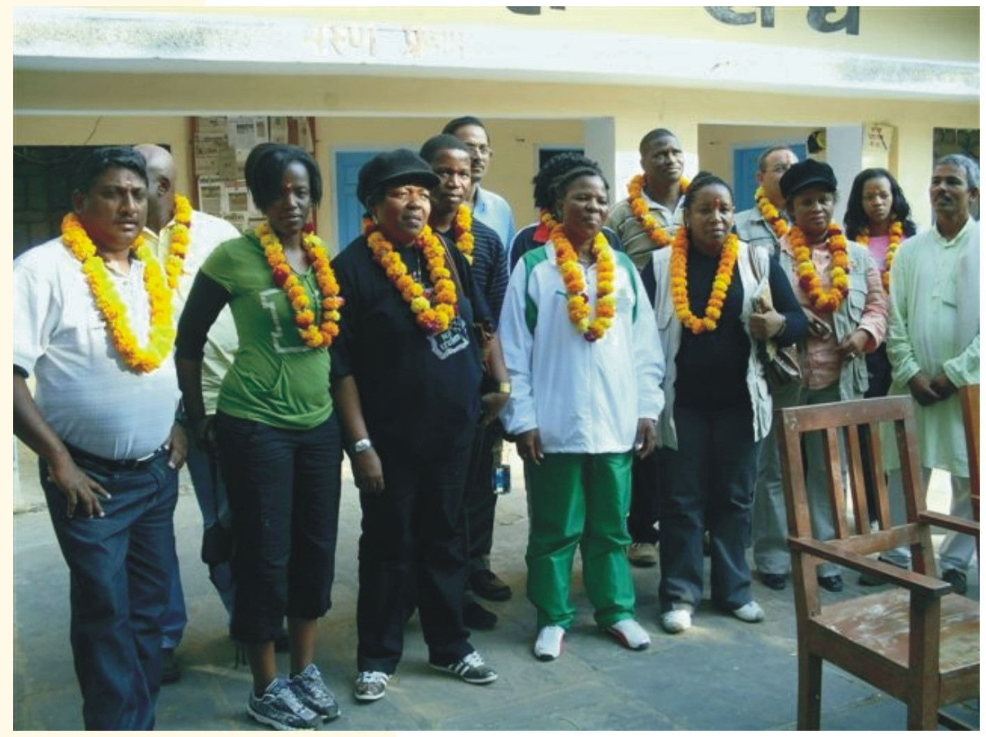
Delegates to India: Visiting one of the projects

As the Department of Public Works we would like to extend our condolences to those that lost their loved ones during the recent attacks in Mumbai.