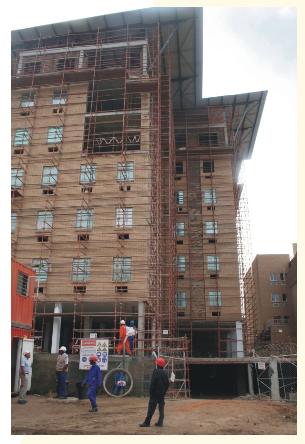
Infrastructure delivery: New Public Works office building - "Works" Towers