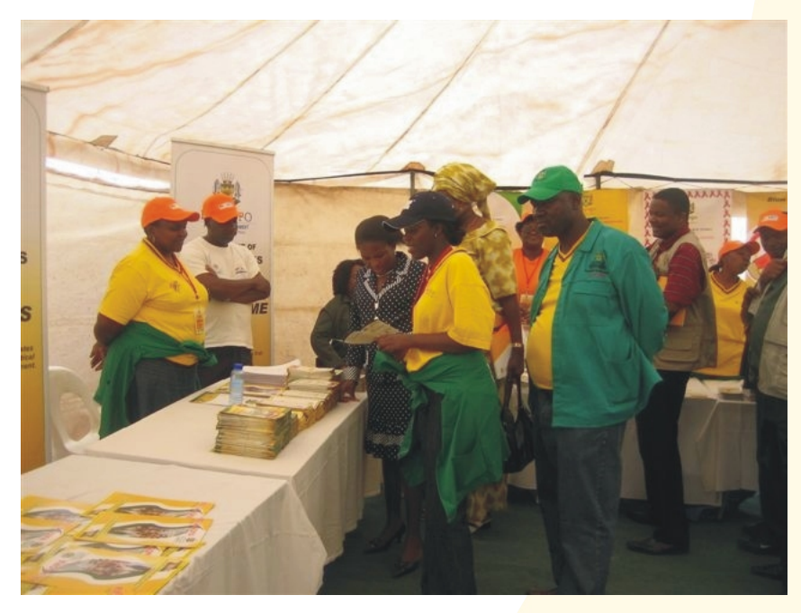
MEC visiting our stall on the day

The stall beat other stalls hands down, in terms of the number of people that visited it, this is thanks to the well informed staff and the loaded goody bags the people got. This was also due to the aggressive, clear branding by the department, which highlighted all core functions including its flagship programme, the Expanded Public Works Programme.