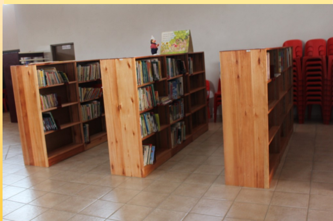
Fully furnished and ready for services