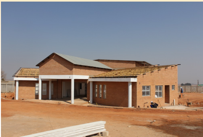
The newly constructed Vlakfontein Library

In a continuous effort to render quality infrastructure delivery to the community, Limpopo Department of Public Works as a leader in the provision and management of provincial government buildings continues to provide Infrastructure to the community of Vlakfontein, Elias Motsoaledi Local Municipality.