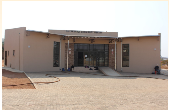
Completed project: Phaahla Library in Sekhukhune

nership with Limpopo Department of Sports, Arts and Culture as the end user of the infrastructure after completion.