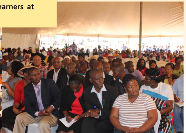
Members of Community listening to the key note address by the Premier Cassel Mathale .