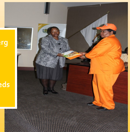
Waterberg District Mayor receive Title Deeds for

The same event was also utilized to handover title deeds as the three Municipalities receive title deeds for farming land for agricultural purposes, Mogalakwena Local Municipality received two title deeds, Mookgopong Local Municipality received one title deed and Lephalale Local Municipality received two title deeds.