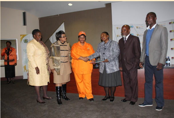
District Mayor receive incentive Agreement protocols while Local Municipality looks on.

The National Department of Public Works held an Expanded Public Works Programme (EPWP) Municipal Summit in November 2011 at Gallagher Estate under the theme: "Accelerating towards the delivery of 4, 5 million work opportunities to the poor". The Limpopo Department Of Public Works hosted the Provincial EPWP Summit on the 12 th to the 13 th July 2012. The Summit was successful as it has paved ways and has had municipalities committed to the implementation of EPWP.