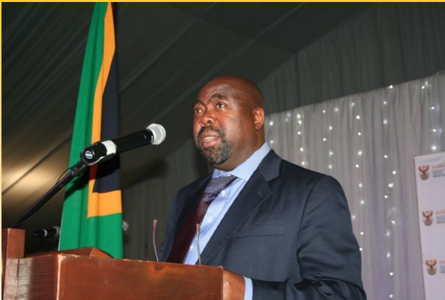
Minister Thulas Nxesi gives key note address at Kamoso Awards

Minister awards best performing province